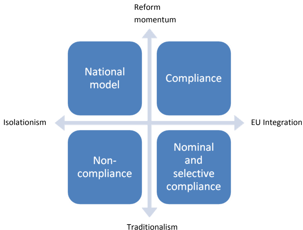
Figure 2 Paths of political-administrative reform and compliance with the EU.

the ‘new’ post-SFRY and post-Tudjman era has taken root” (SIGMA 2004). Following acknowledgement of compliance with the ICTY, the country gained candidate status in 2004 and entered a new period of wide-ranging reforms to comply with EU membership criteria. Changes in the system of government included the abolishment of the previous semi-presidential system and one of the two chambers of the parliament (SIGMA 2004). The legal framework for the organization of the state administration is provided by the constitution (last amendment 2001) according to which holders of public powers are responsible to the parliament and access to civil service is open for all citizens (Article 44). Organisation operation and decision-making are regulated by law except for internal organisation of ministries which is in government’s authority. The first substantial step towards public administration reform came in the form of a Croatian Government Action plan in 2000, which aimed at preventing further expansion of public administration, decentralization and strengthening local and regional self-government, horizontal decentralization delegating some public administration affairs to independent non-governmental organizations (Vidačak 2004).