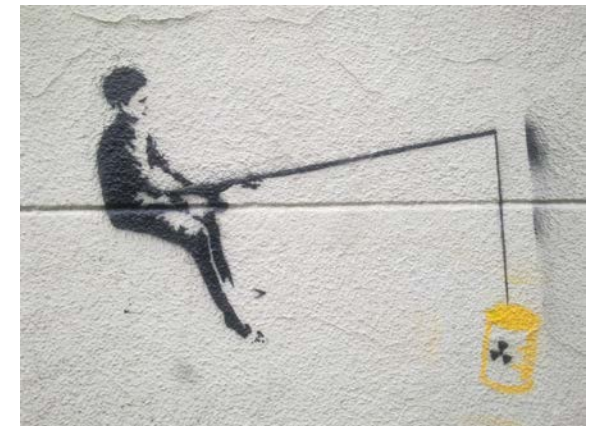
streetart in Dortmund, unknown artist