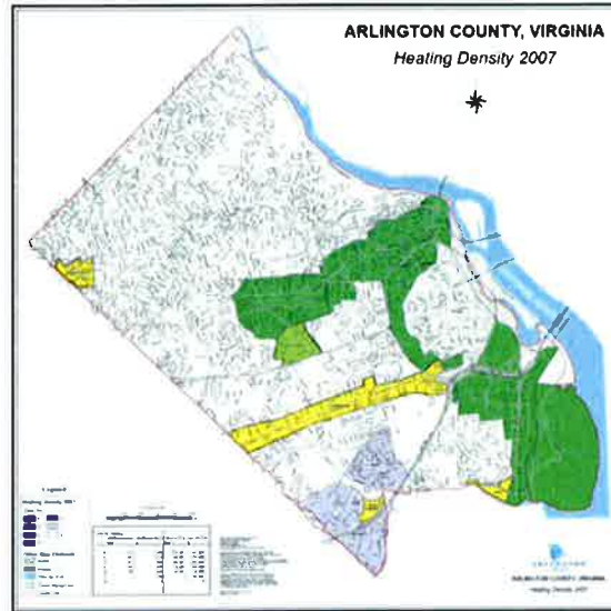
Figure 2: Arlington County – Potential District Energy Zones

The CEP also calls for about 150 MW of distributed cogeneration to both reduce the peak loads on the wider grid, to generate heat for the district energy system and to greatly reduce the GHG footprint. To both reduce the summer peak, and to further reduce GHG emissions, the plan recommends installing a total of 160 MW of Solar PV capacity by about 2035. Like the widespread increases in efficiency, these strategies have the potential to promote transformational job growth in the district energy, and clean and renewable energy sectors.