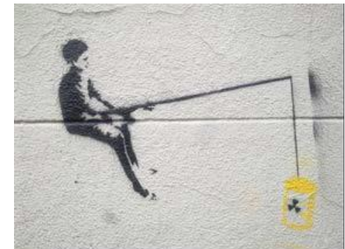
Graffiti in Dortmund, unknown artist