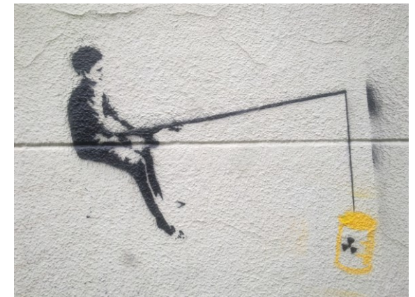
streetart in Dortmund, unknown artist