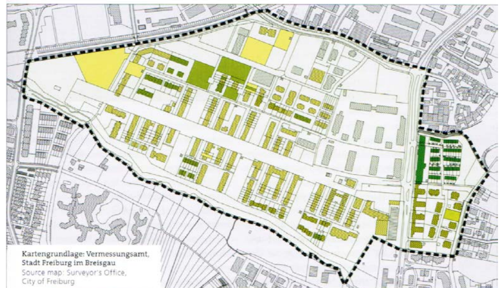
Energiestandards bei der Bauweise im Stadtteil Vauban Building Energy Standards in the Vauban District