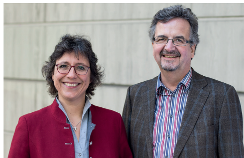
OUR RESEARCH DIRECTORS (2018)