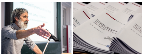
HUMBOLDT LECTURE (2016)

Overall, the activities of the KFG have resulted in numerous publications, including monographs and edited volumes by its directors and visiting researchers, as well as its Working Paper Series. Until today, 82 Working Papers have been published and are accessible online on our website.