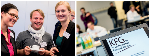
KFG CONFERENCE (2013)

With its (post-)doctoral fellowships, the sabbatical program, and the invitation of top senior scholars, the KFG has provided a supporting and stimulating environment for quality research. Especially the promotion of young researchers has been a core task. They have been supported to discuss and forward their projects at the weekly Jour Fixe meetings, to organize workshops and participate in conferences – at home and abroad.