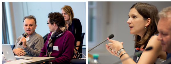
KFG CONFERENCE (2013)

The KFG has engaged in a wide array of activities to develop its research agenda and foster knowledge exchange among scholars and practitioners, such as policy-makers and the media. Thanks to our annual international conferences, book talks, and other events, the KFG has achieved high international visibility and disseminated its research results beyond academia.