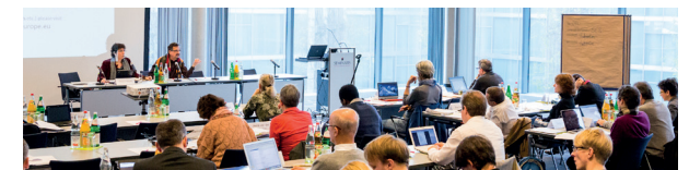
KFG CONFERENCE (2013)

For answers to these questions we invite you to have a look at our publications section on the website.