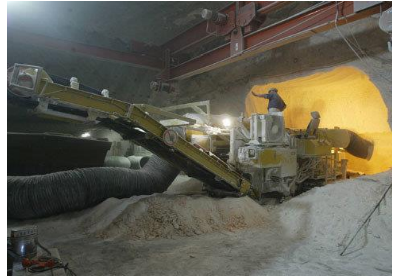
126.000 barrels of nuclear waste at Asse II