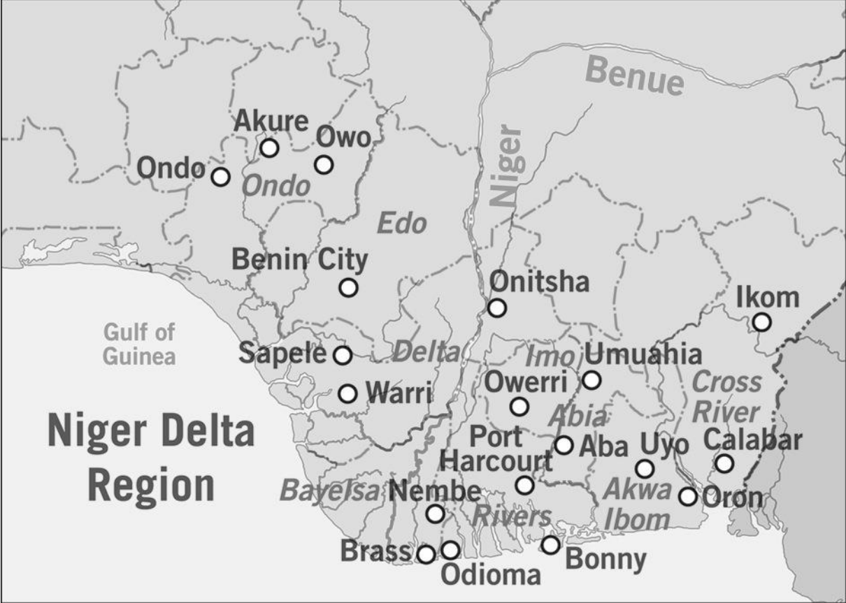
Figure 1: Map of the Niger Delta