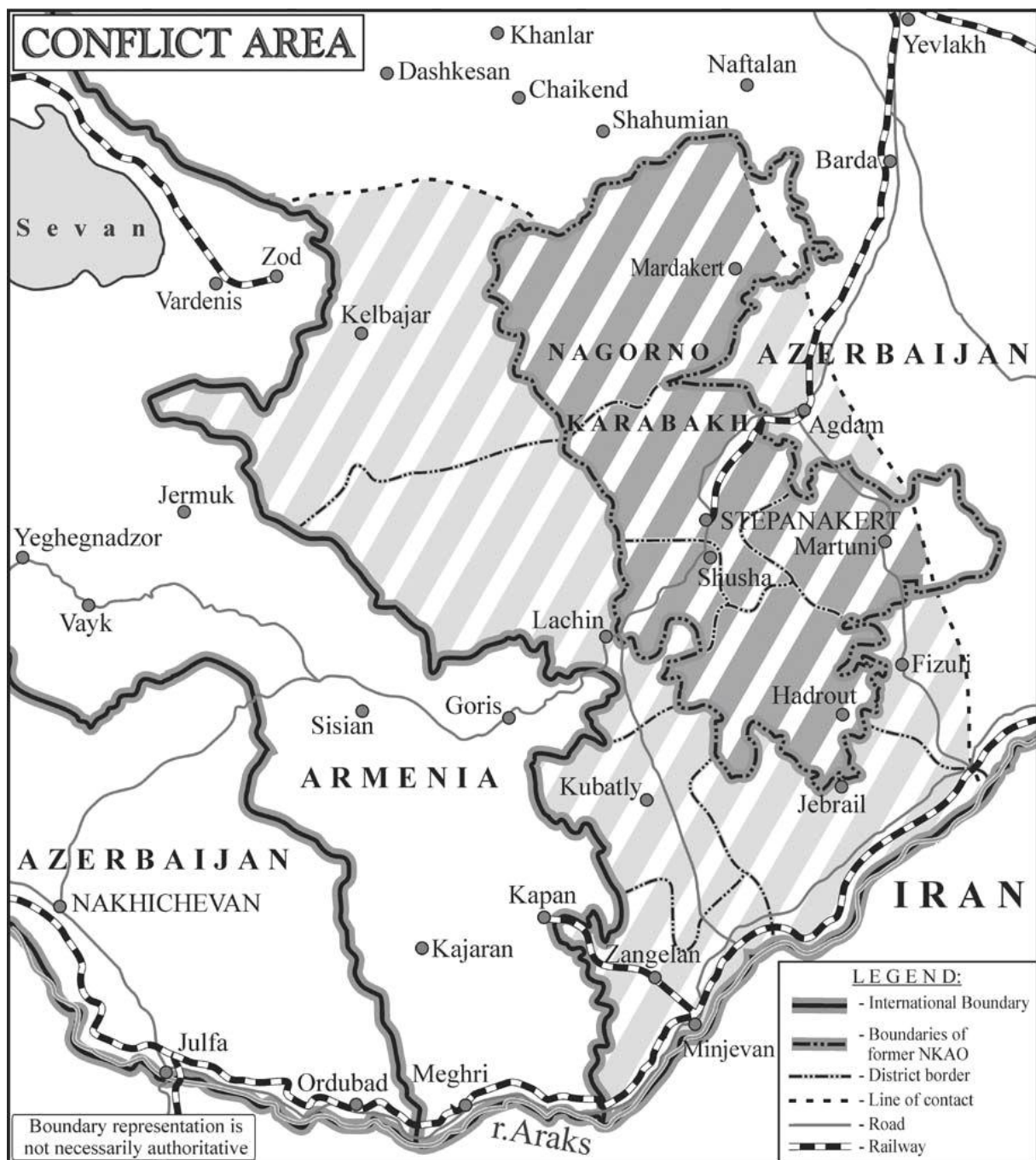
Figure 2: Map of Nagorno-Karabakh