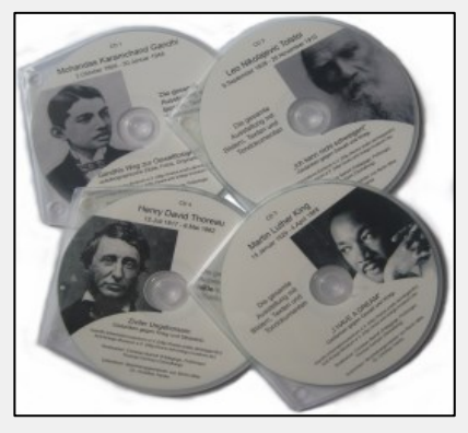
CDs & DVDs

Our exhibitions are freely accessible on the internet and on CDs and DVDs for educational use. They contain the complete set of panels along with additional documents for civic, cultural and historical education for nonviolence and peace.